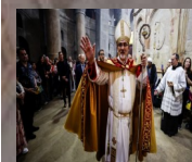
Cardinal Pierbattista Pizzaballa Latin Patriarch of Jerusalem

This is the way we all come together despite everything, and unite collectively in prayer, to deliver to God the Father our thirst for peace, justice, and reconciliation."